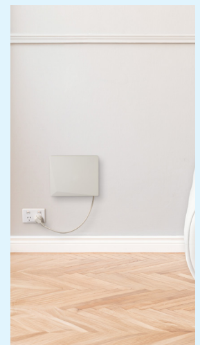
nbn connection box mounted on the inside surface of an external wall