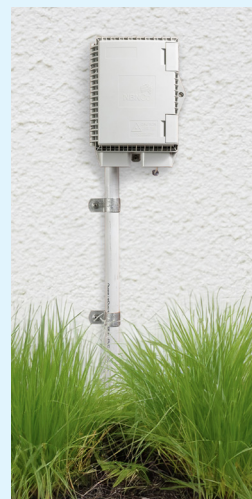
nbn utility box mounted on the surface of an external wall